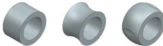
Fig. 2: Steel inserts for pins (regular – concave – convex with notches)

Composite material has its specifics which must be followed during the design process. Geometry optimization is necessary to reduce stress concentration in specific regions such as bonding areas in hybrid structures. For that reason, several geometries shown in Fig. 2 have been analyzed. Analysis results showed that for selected technology the convex shape of pin insert is the best “mechanically oriented” solution and regular shape insert is the acceptable “simple way” solution of pin insert. (Zbončák, 2024)