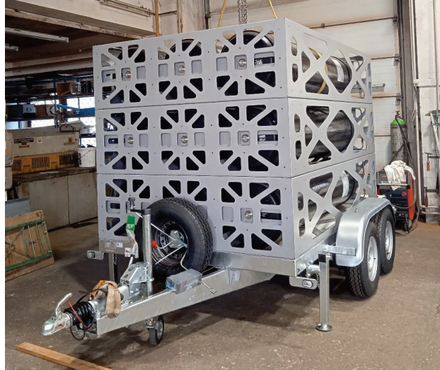
Fig. 1: Trailer with the mobile refueling station.

The developed mobile hydrogen refueling station (see Fig. 1; Polach et al., 2022) is a device designed for the convenient transport of compressed hydrogen and the subsequent refueling of hydrogen-powered vehicles or other compatible equipment. It enables the refueling of passenger cars with an operational hydrogen pressure of 700 bar, buses (or trucks) with an operational hydrogen pressure of 350 bar, and material handling equipment with a pressure of 350 bar.