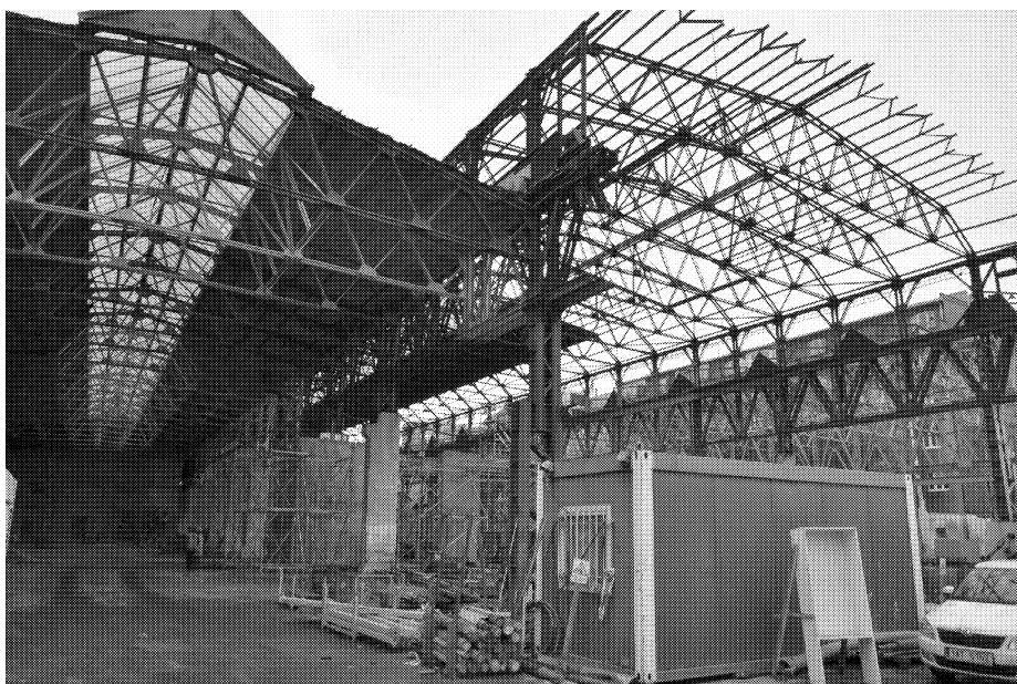
Fig.1: Former factory for boiler production in Prague – Karlin under reconversion

When out of use the industrial heritage buildings are degrading and often turning into ruins. Re-use and adaptation of such structures allow for integration of the industrial heritage into a modern urban lifestyle and help protect cities' cultural heritage [2, 3, 4]. These structures are often adapted to become hotels, museums, residential parks, commercial centres etc. as buildings located in city centres profit from available transport network.